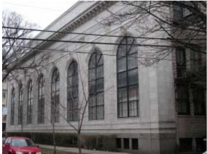
Common facade treatments found in Classical Revival-style banks include the “temple-front” (above left) as exemplified by the South Side Trust and Savings Bank, and the use of large arched windows (above right) as seen at the Fullerton State Bank.