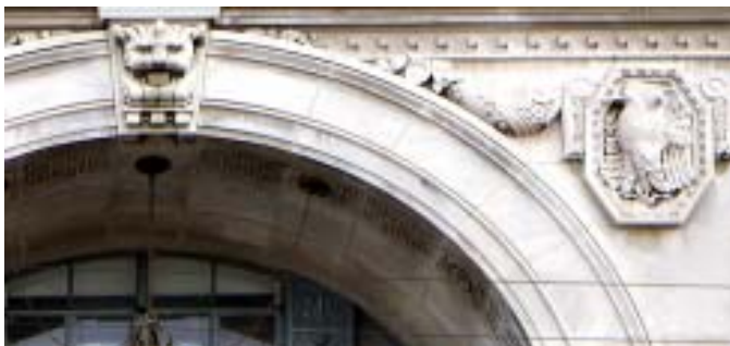
The rendering above accompanied a 1928 report in the Chicago Tribune on the then ongoing construction of the Belmont-Sheffield Bank. The detail (left) is of the carved limestone entrance arch on Belmont Avenue.