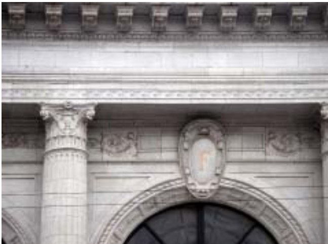
A cartouche at the upper portion of the front facade (above) is engraved with the letter “F” a reference to the Fullerton State Bank. The word “perfection” engraved above the entrance (right) is a reference to the building’s second owner, the Perfection Burial Garment Company.

Both street elevations are highly ornamented with motifs from late-Roman architecture. Urns, rope molding, fretwork, and cartouches frame the window openings, while terra-cotta griffins and garlands are used throughout the facades. On both street elevations, the pilasters and columns are topped with a molded entablature and prominent bracketed cornice topped with a raised parapet. The exterior of the building displays excellent integrity in terms of its historic design, materials and detailing.