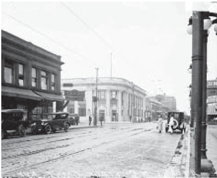
The South Side Trust as it appeared in a 1922 photograph by the Chicago Daily News (left). Details of the building's carved limestone cladding and ornamental metal spandrel panels (below).

Like many other banks in the early 1930s, heavy withdrawals forced the South Side Trust and Savings Bank to close on June 6, 1931. Though it remained in receivership throughout the 1930s, the institution managed to survive the Depression, and continued to use the building as a bank until 1972. After a period of vacancy and neglect, the building underwent an extensive restoration in 2006. It again serves as a neighborhood bank, with professional offices on the second floor. The exterior of the building displays excellent integrity in terms of its historic design, materials and detailing.