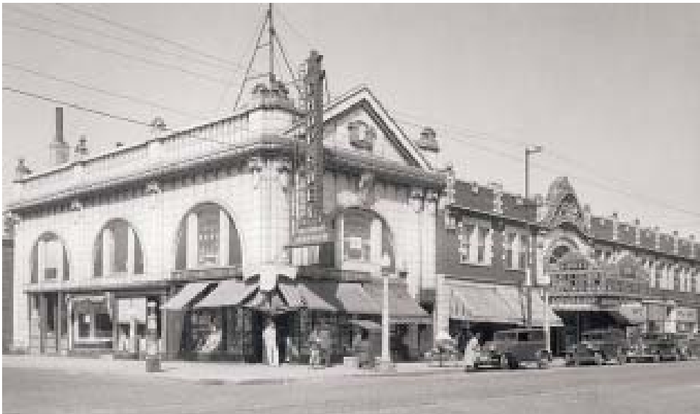
A circa 1940s photograph of the bank (above), and a detail of its architectural terra cotta (right).

The Clark Street elevation features a large, decorative keystone that connects the arched window with the cornice above. The keystone features a stylized eagle and Chicago's municipal Y symbol. The building's street elevations are surmounted by a projecting cornice with organic rounded forms and a Classical balustrade with piers topped by scrolled projections. The high pediment that crowns the Clark Street elevation features a cartouche surrounded by cornucopia with fruit. The building's first floor has been altered with the installation of continuous plate glass display windows along both elevations and a recessed corner entrance, but overall the building maintains very good integrity.