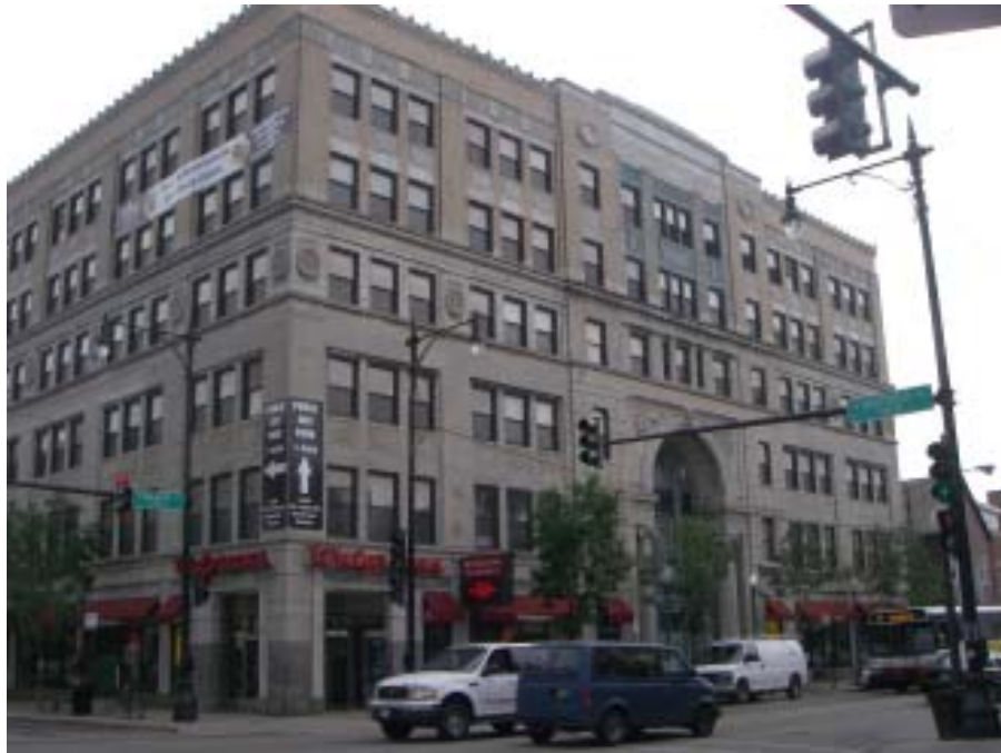
To maximize valuable real estate, some bank buildings incorporated multiple, income-generating uses into the overall design. At the Belmont-Sheffield Trust and Savings Bank (above), the banking hall originally occupied the central part of the first two stories, while the remaining area of the second floor and the entire third floor was used for rental offices. The ground floor was also occupied by retail uses, and the upper three floors were used for hotel rooms.