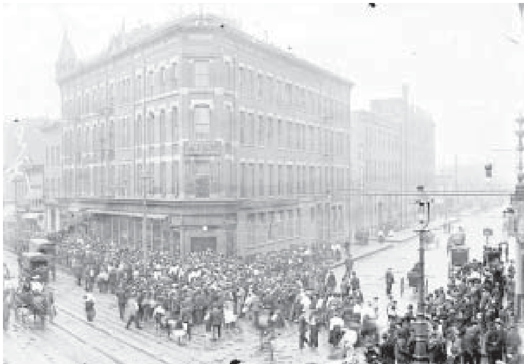
Bank failures in 1906 created an economic recession in 1907 that led many states to pass laws regulating the banking industry, including prohibiting branch banking. This photos shows a “bank run” on the Milwaukee Avenue State Bank in August 1906. The bank, now demolished, was located at 739-47 Milwaukee Avenue.

During the first half of the twentieth century, Illinois state laws prohibited banks from opening multiple branches. The intention of the law was to prevent the growth of bank monopolies and to support small independent banks. As a result of the law, a large number of independent banks were established throughout Chicago neighborhoods to serve the banking needs of local communities, including mortgages, business loans, and checking and savings accounts for middle- and working-class residents. Neighborhood banks focused on catering to, and reinvesting in, their surrounding communities, responding to the need for local financial services. The growth of outlying banks in Chicago was very closely tied to real estate development in the neighborhoods, and in many cases, handsome profits of the banks were due to profits made on their real estate loans.